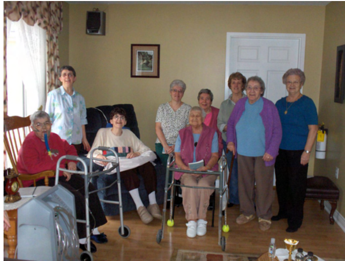
Communion Home Visits