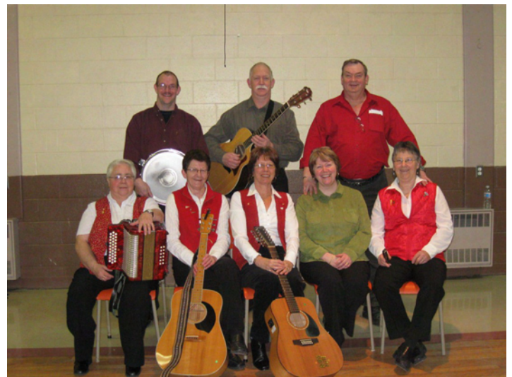
Saints Alive 2009